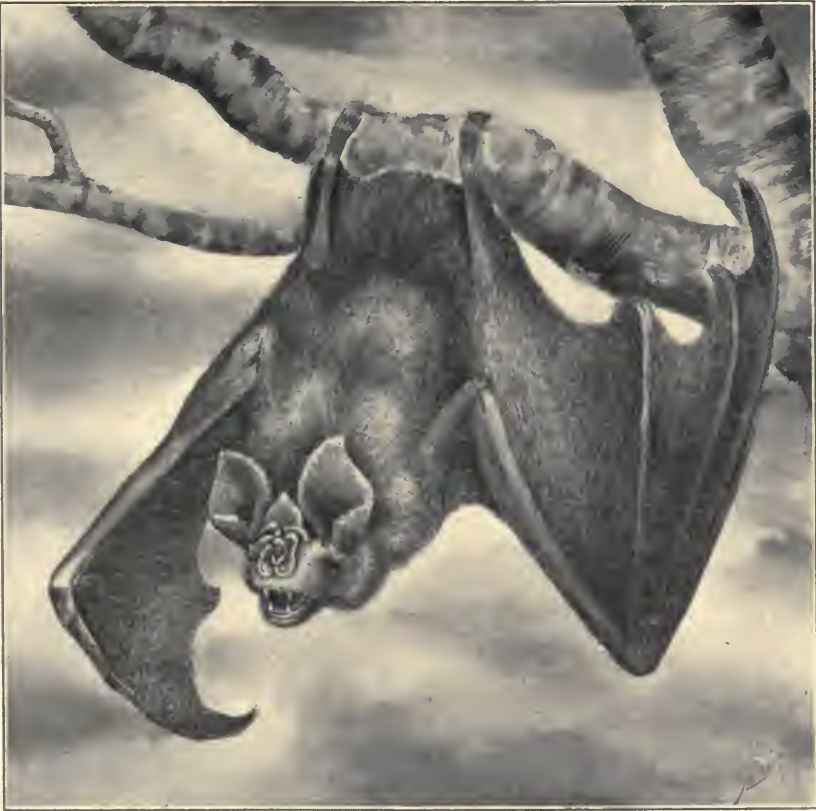
FIG. LXV. RHINOLOPHUS FERRUM-EQUINUM. THE GREAT NOSE-LEAF BAT.